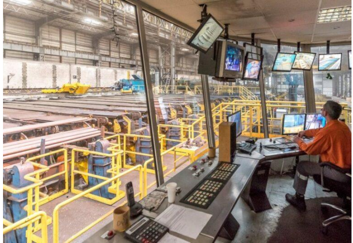
Figure 1 The view of manufacturing plant located in Warsaw

ArcelorMittal Europe has a long and rich tradition of producing bars and wire rod in its locations in Germany and Poland (covered by this EPD). ArcelorMittal Hamburg plant is located at Germany's largest sea port which is an important logistical advantage. ArcelorMittal Hamburg is acknowledged as a global leader in high-quality wire rod production. It is also a pioneer in melt shop productivity and energy efficiency. ArcelorMittal Warszawa plant is located at the northern edge of Warsaw and is acknowledged as a specialized production facility in SBQ and special bars.