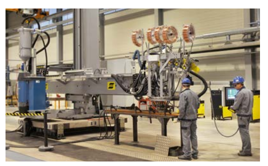
Welding laboratory: Multi-wire Submerged Arc Welding (SAW)

ArcelorMittal's full engineering approach begins with characterisation of materials and continues through to component testing.